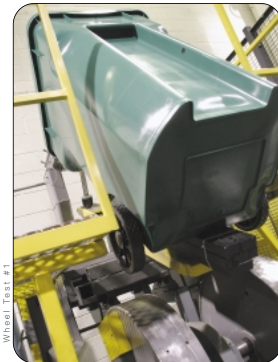
Wheel Test # 1

Cascade Engineering uses an extensive research, development and testing laboratory that meets and exceeds all ANSI standards. This in-house testing ensures our customers are provided with the highest quality, most durable containers available in the solid waste industry.