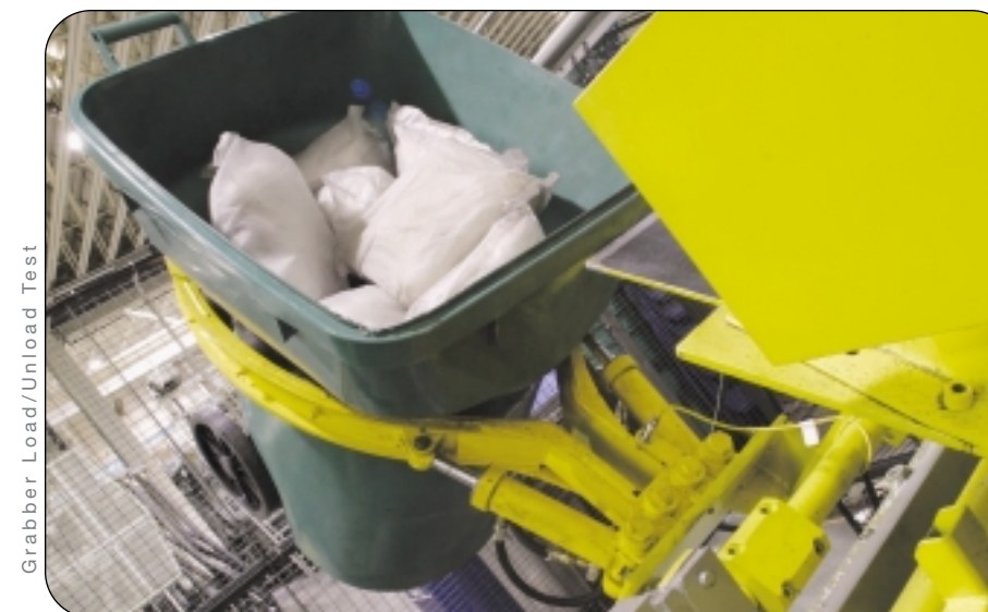
Grabber Load/Unload Test