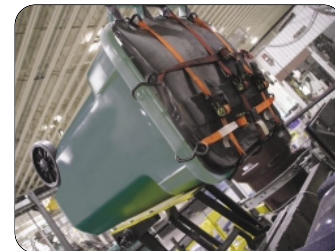
Two-Bar Lift Test